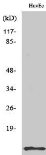
Western Blot analysis of various cells using ACBP Polyclonal Antibody